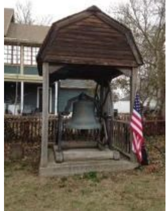
Bell from the original Wallingford Town Hall

Capitol, Ebenezer Baptist Church in Atlanta and from battlefields, national cemeteries, state capitols, county courthouses, town halls, historical sites, universities, schools, homes and places of worship. Bells were rung precisely at 3:15 p.m. EDT for 4 minutes, with each minute symbolic of a year of the war.